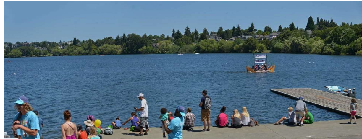
Heading for the finish line