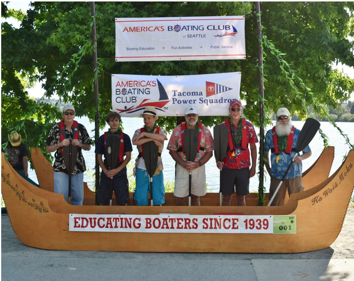
The boys in the boat are from Tacoma, Seattle and Everett Power Squadrons.

Many thanks to Seattle PS for their logistics on race day. Their previous experience in the milk carton derby was very beneficial. They made a long day at the event comfortable, fun and relaxing.