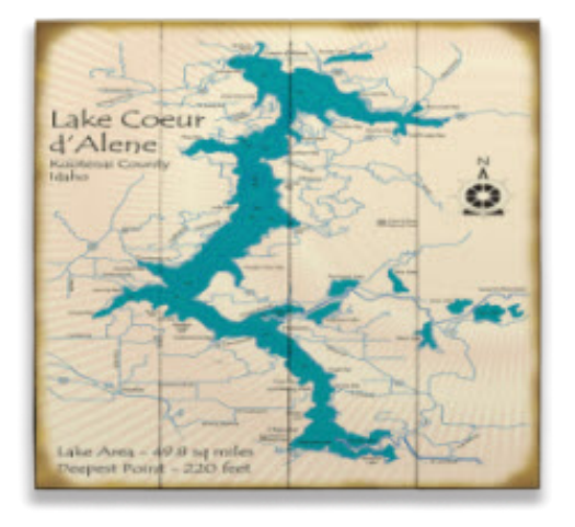
Coeur d'Alene "FUN @ THE LAKE" - October 2019

Technically, the USPS D/16 2019 Fall Conference runs just a day and a half - Friday evening and all day Saturday, 11-12 October. But the conference theme offers you an open invitation to extend your visit to Coeur d'Alene and explore some of the many ways to have "Fun @ the Lake."